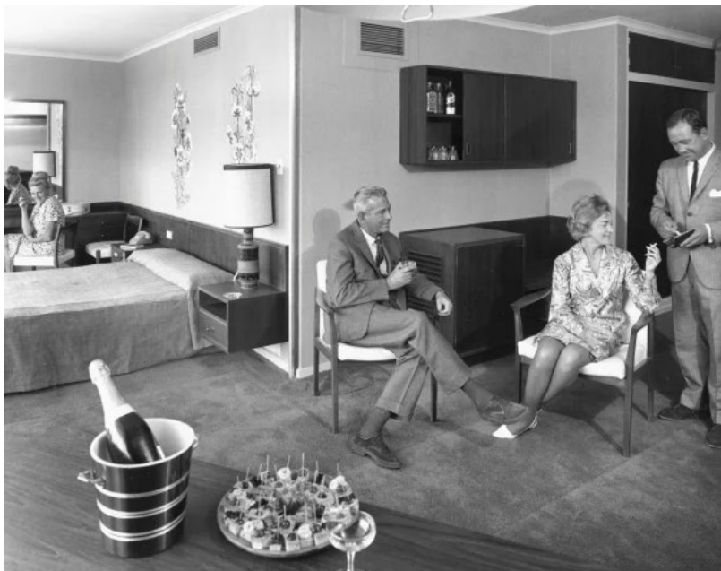
Max Dupain & Associates image of Kafka cabinetry in hotel chain from AFR “Sydney’s Forgotten Mid-century Modernists.”

Other known projects of Kafka – of which evidence survives to varying extents – include 19/123 Macleay Street Potts Point, of which the Powerhouse Museum holds 7 drawings of different furniture items and lounge room elements, and 861 New South Head Road, Rose Bay, which contained some items of significant internal furniture still in 2011 when a major DA was lodged for the remodelling of the property. 5 It would appear that both of these addresses have since lost their Kafka designed interiors with items destroyed, resold or acquired by museums. This would also appear to be the case with the large amount of cabinetry Kafka design for hotel chains in Sydney as illustrated below, given the changeable and trend-driven nature of hotel interiors. 6 The above projects listed indicate the relative scarcity of intact Kafka interiors and the increasing threat that such examples of his work are under. The comparative assessment supports proceeding with a heritage listing for 33 Young Street, Wahroonga.